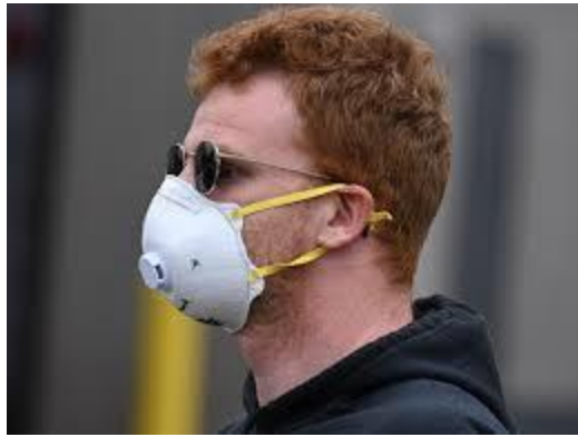
Masks with valves

Let me take some time on masks with valves. The purpose of the valve is to allow your exhalation to more freely flow away from your face making it more comfortable. The problem is the valve allows your exhalation to more freely flow away from your face making it more dangerous for the people around you. The main purpose of the surgical mask is to protect others. (It also protects you.) Wearing a valve defeats the purpose. It yells to the world. Me first, I don't care about you. As long as I'm comfortable it's ok if I'm putting you at risk.