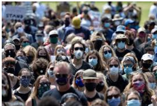
Thinking they make you bullet proof.

Let me take some time on masks with valves. The purpose of the valve is to allow your exhalation to more freely flow away from your face making it more comfortable. The problem is the valve allows your exhalation to more freely flow away from your face making it more dangerous for the people around you. The main purpose of the surgical mask is to protect others. (It also protects you.) Wearing a valve defeats the purpose. It yells to the world. Me first, I don't care about you. As long as I'm comfortable it's ok if I'm putting you at risk.