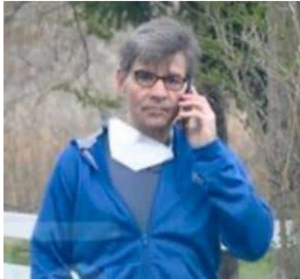
Not wearing it