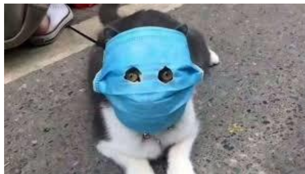
That's just not right